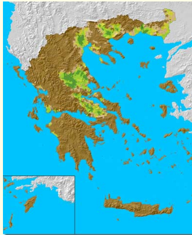
Figure 1: Areas of cotton cultivation in Greece